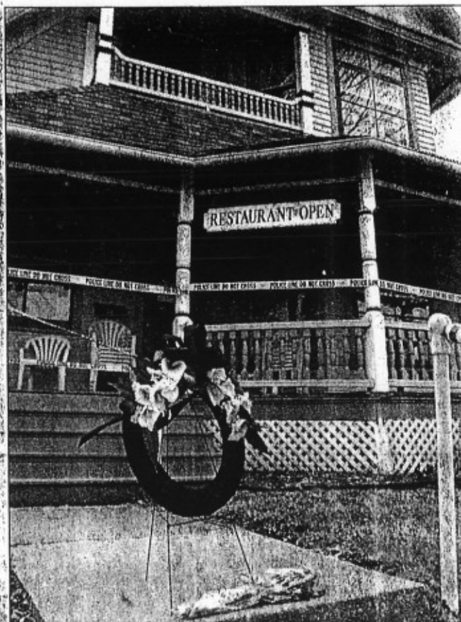
A wreath stands outside Richard Hauff's Black Angus restaurant, and police tape cordons off the scene where he was shot to death.

Once released from the hospital, Hauff reopened the Black Angus, and started cooking